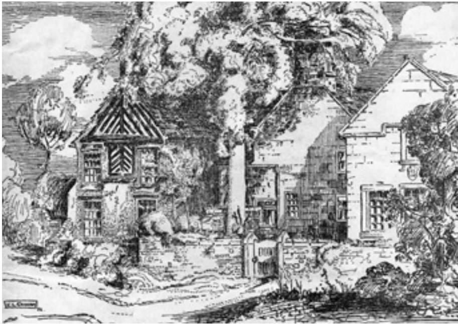
Drawing of Gawber Hall, Barnsley Private owner