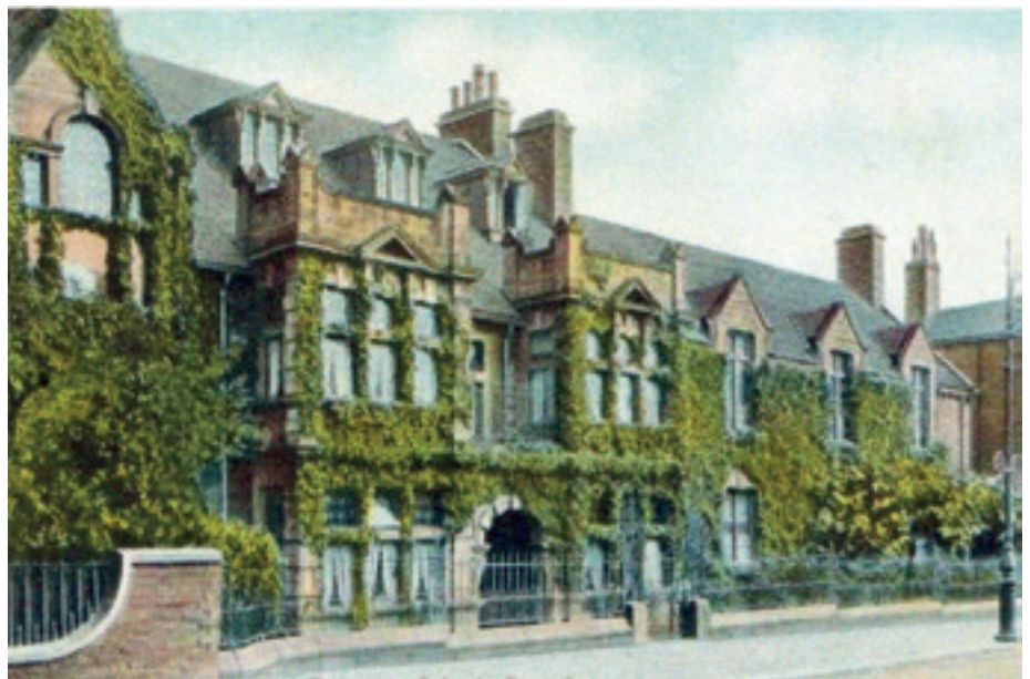
Holgate Grammar School in the early 20th century from an old postcard. Part is now the Cooper Gallery