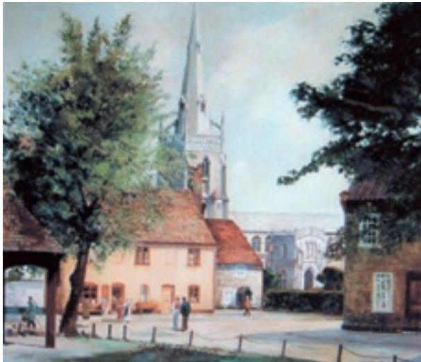
Painting of Woolpit village courtesy St. Edmundsbury Heritage Service