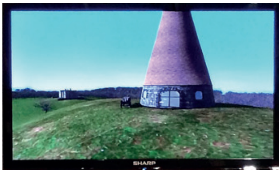
The two-minute digital animation on show at the exhibition

student at Horizon Community College. He was 17 and had moved to Barnsley College when the film was finished.