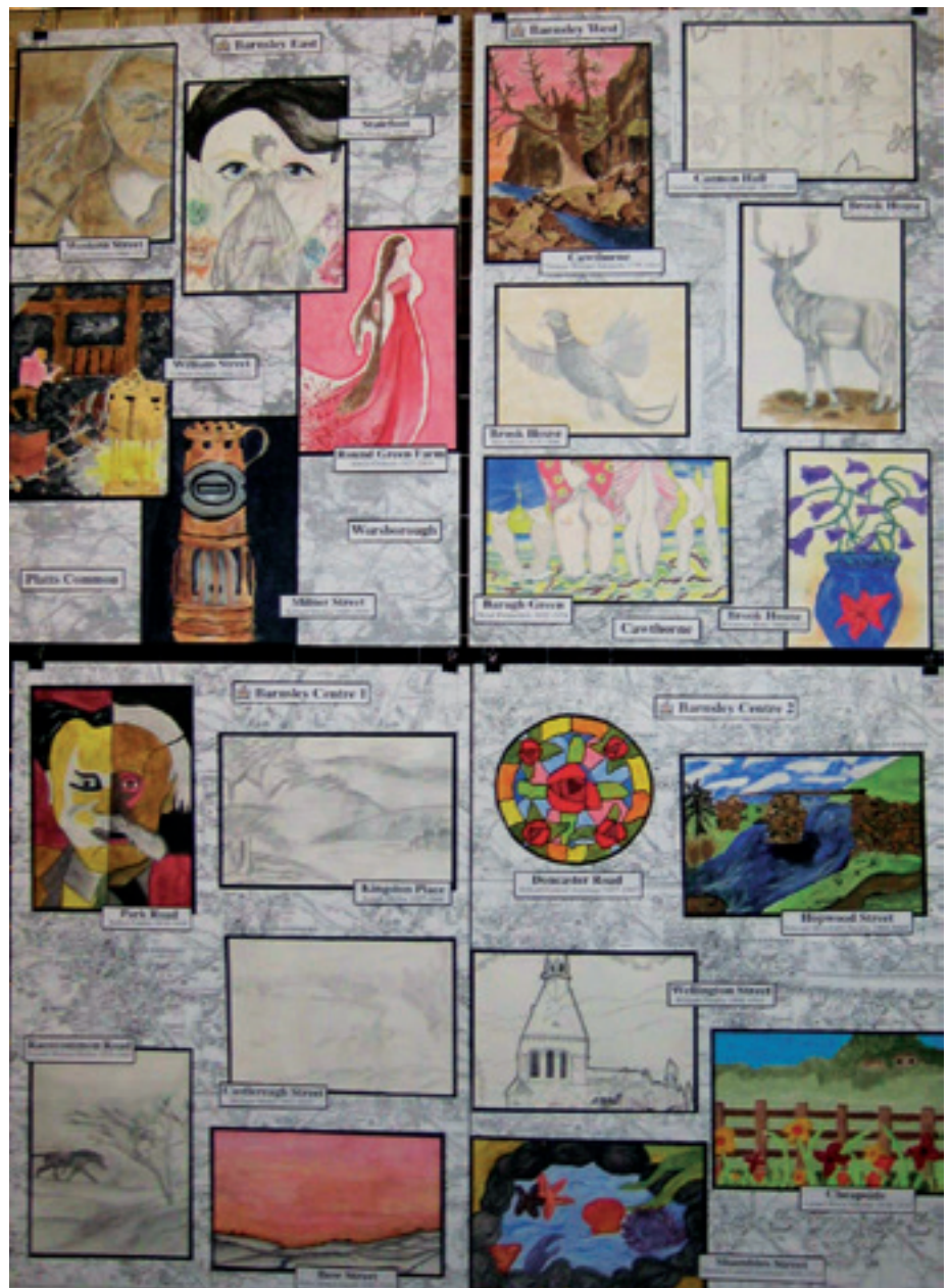
Entry to the Barnsley Map competition by Shafton ALC pupils