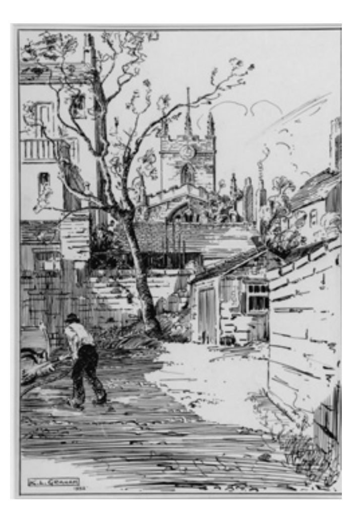
St Mary's Church (from Eastgate)