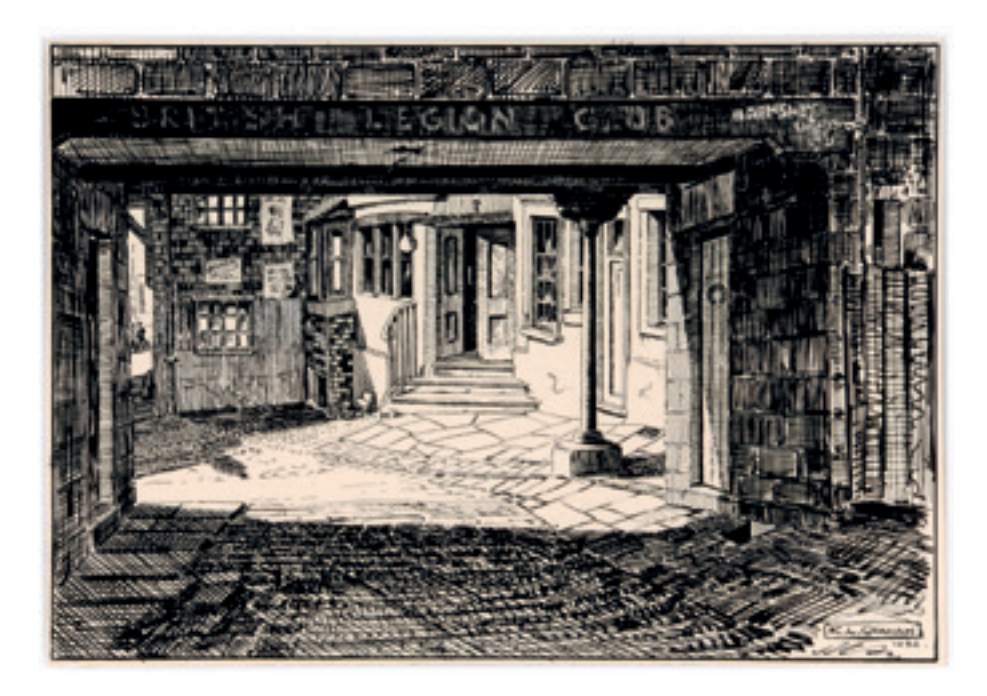
BELOW Old White Bear Yard, Shambles Street