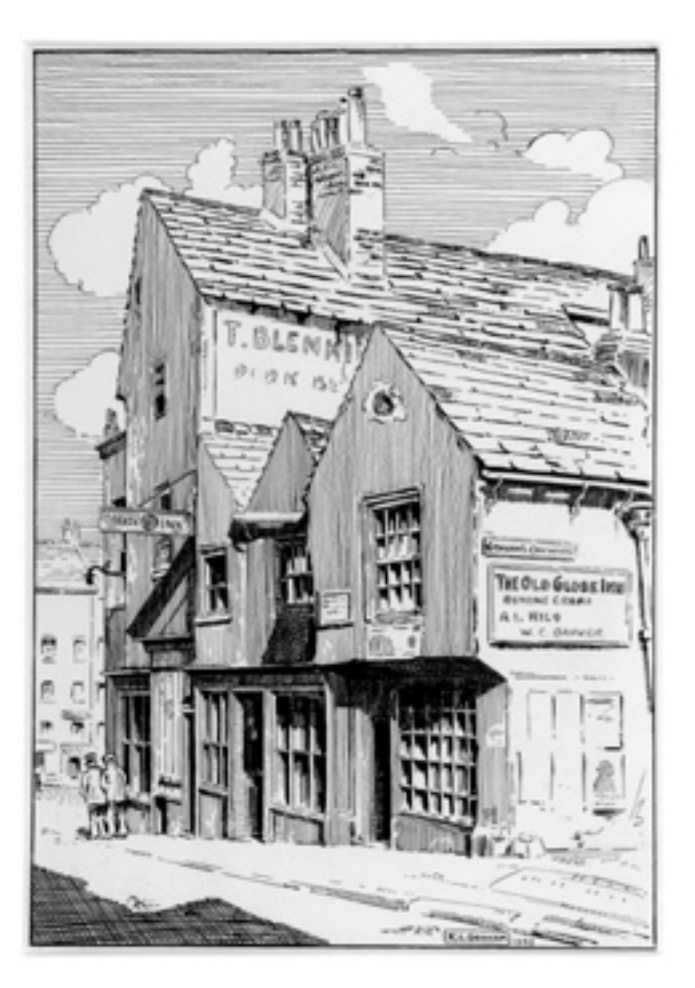
The Old Globe Inn, Shambles Street

The building on the right at the top was a linen factory, producing linen which was renowned across the country. Horse-drawn wagons collected the linen and transported it a short distance to Greenfoot where it was bleached by being laid in strips across the grasslands. Near the top stood the pinfold where stray horses, cattle and other farm livestock were impounded.