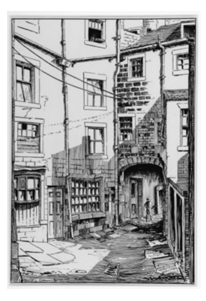
Passage, no. 3 Queen Street