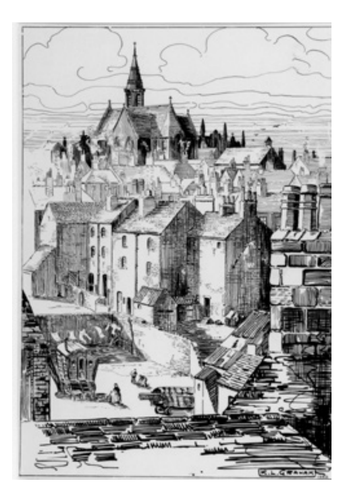
Across to Holy Rood from Wellington Street