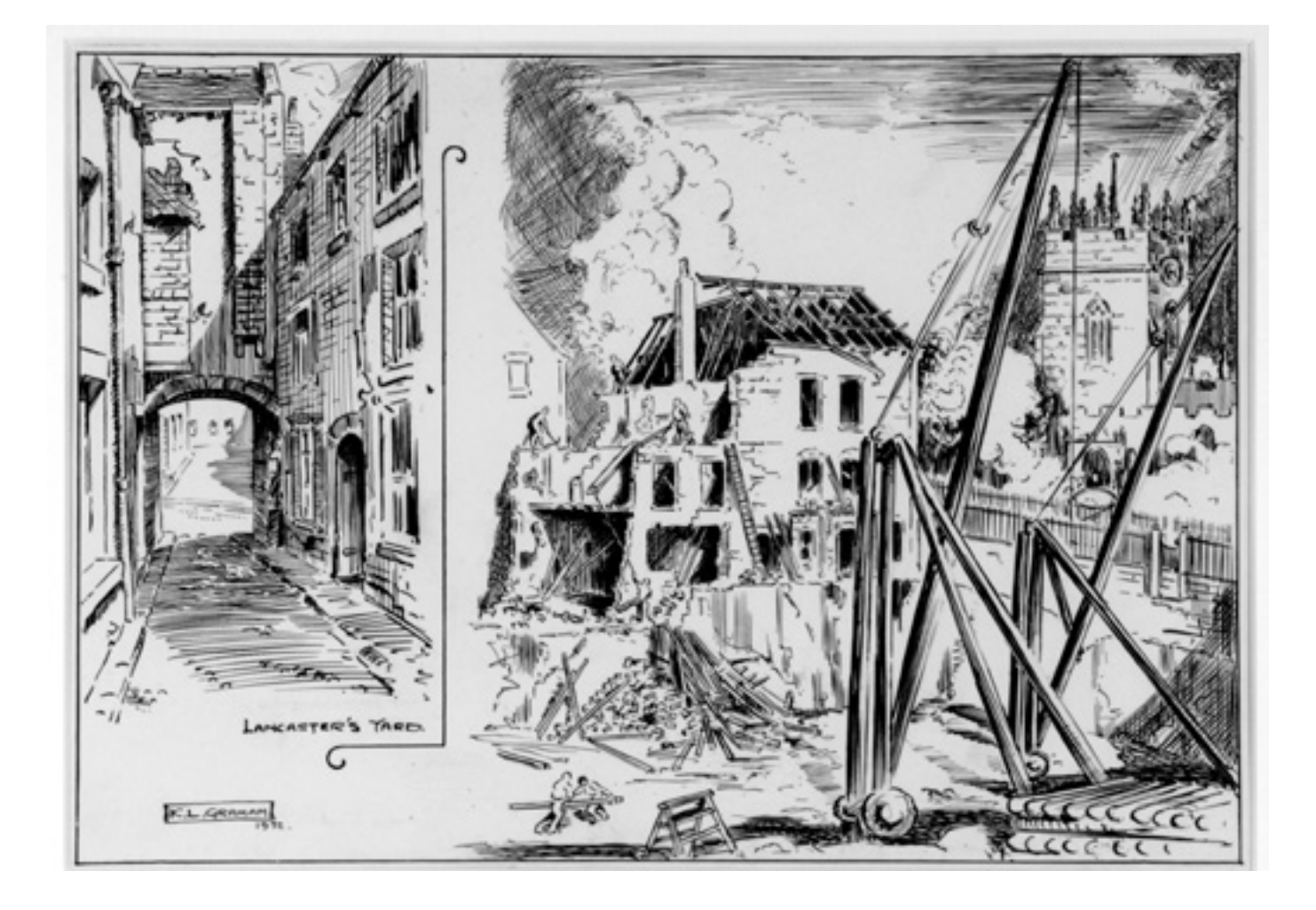
BELOW Demolition/Manor House, Church Street