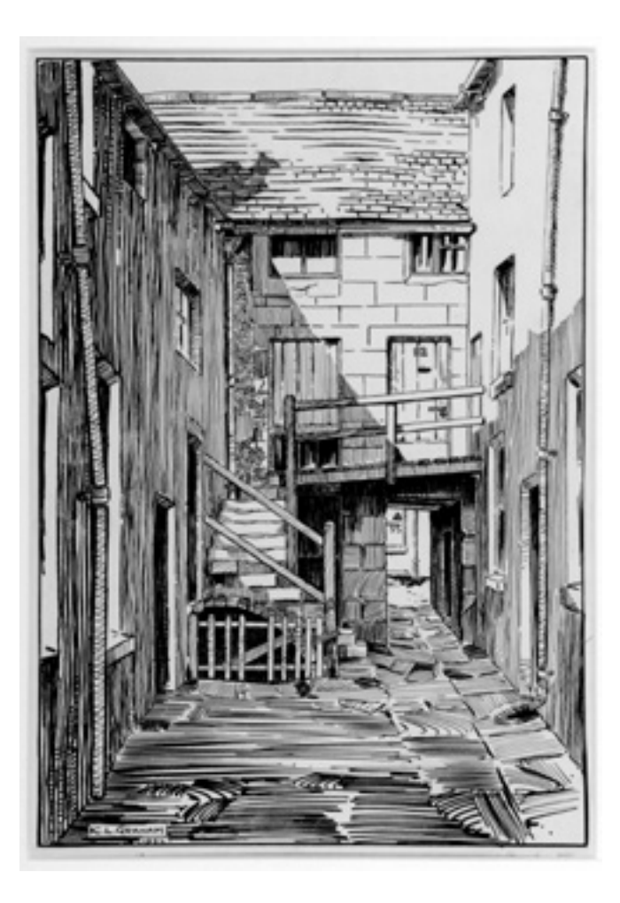
Temple Yard, Market Hill

in 1968. Tithe barns were used to receive and store tithes, which were a 10th of tenant farmers' and labourers' annual produce. This ancient system was used to provide for the local church and Rector and the support of the poor of the parish.