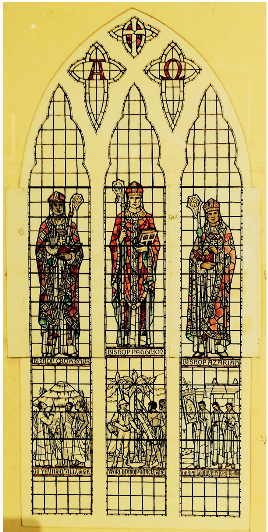
Stained Glass design by Edward Liddall Armitage for St Mark's Church Bromley