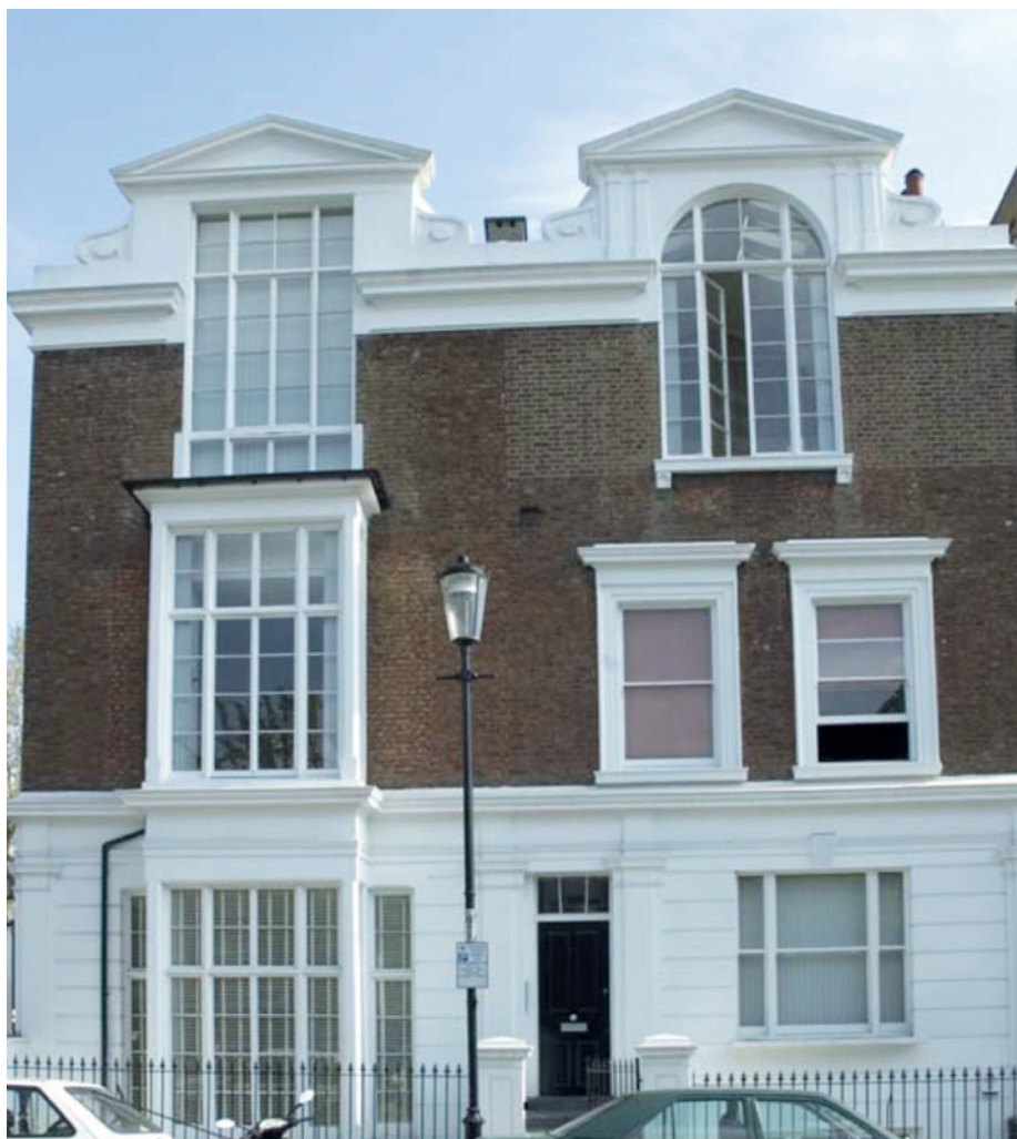
Artisan's House Blenheim Crescent London.