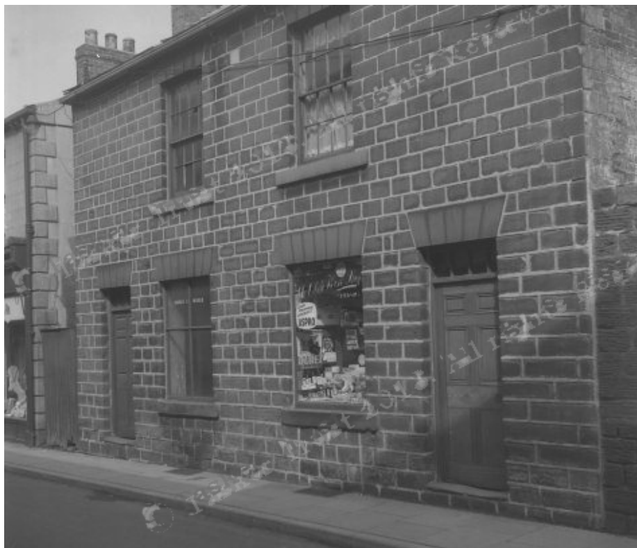
18 and 20 Market Street, Barnsley Demolished for redevelopment in 1962 (The herbalist shop is on the right)