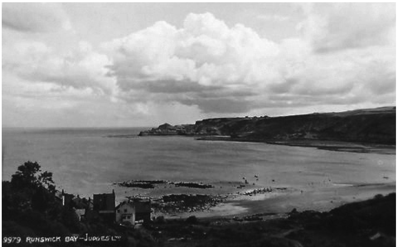
Runswick Bay from near Bank Top