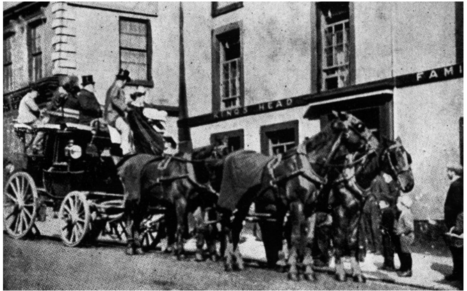
The King's Head Hotel, Market Hill