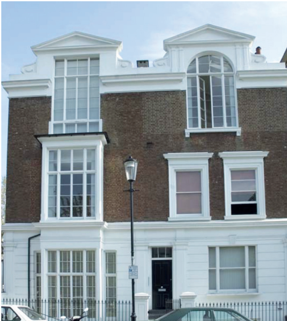
Artisan's House Blenheim Crescent London.