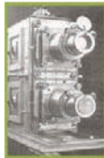
double lens magic lantern

Colour was always Bamforth's signature strength. They perfected the novelty slide and with the flick of a lever, they could transform a drab garret scene into an enchanted floral bower.