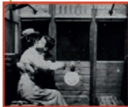
kiss in the tunnel

Their business expanded quickly in the 1870s, utilising 5,000 feet of studio space and producing a stock of 2m slides, such was the scale of their lantern slideshow operation. These exotic shows were used to illustrate lectures, stories and convey moral messages such as moderate alcohol consumption. Bamforth liaised with Riley's of Bradford towards the end of the 19th century and collectively produced a catalogue to rival Hollywood USA in both volume and quality. They were the first firm to make Kinematograph films for public entertainment. The joint endeavours of Bamforth's skill in editing, storytelling with actors, props, costumes and backdrops matched Riley's film-making prowess. They were already producing 75-foot films before this fruitful collaboration that saw the creation of approximately 50 films - 'Boys Sliding', the risqué 'Love in the Tunnel' and 'Leapfrog' being the early ones at the turn of the century and to be found in the archives of The Yorkshire Film Archives in York. Other themes were custard-pie throwing and whitewash slinging with Holmfirth locals taking on parts; the town sometimes had to halt trading for these capers. The bank manager even sanctioned using his premises for a mock raid. No stuntmen were used but an unlucky cameraman was injured by a shotgun prop.