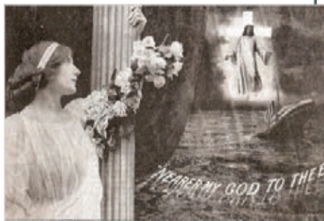
When saucy postcard firm caught mood of a nation in wake of Titanic tragedy