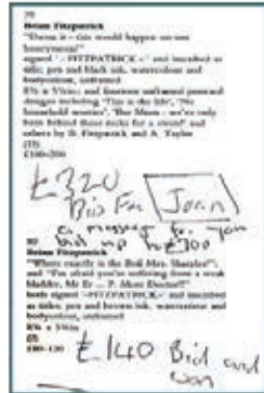
A deltiologist's dream auction!