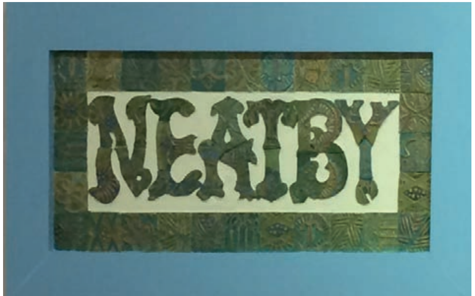
LEFT Winning entries for the poster competition