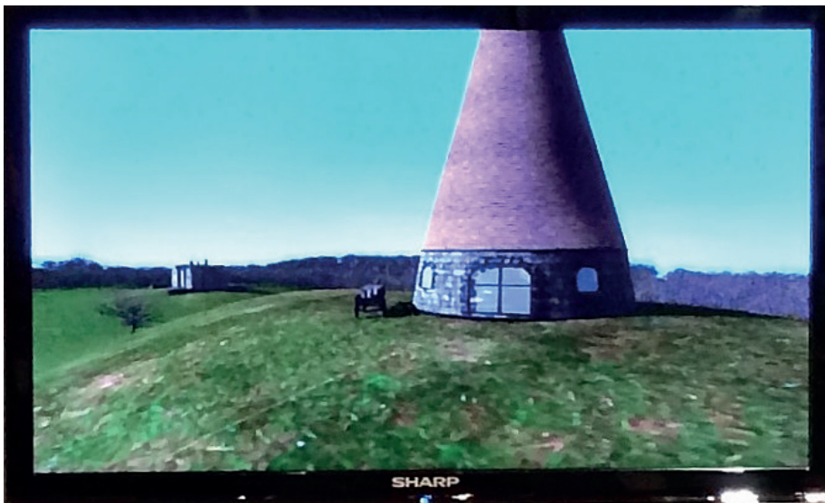
The two-minute digital animation on show at the exhibition

student at Horizon Community College. He was 17 and had moved to Barnsley College when the film was finished.