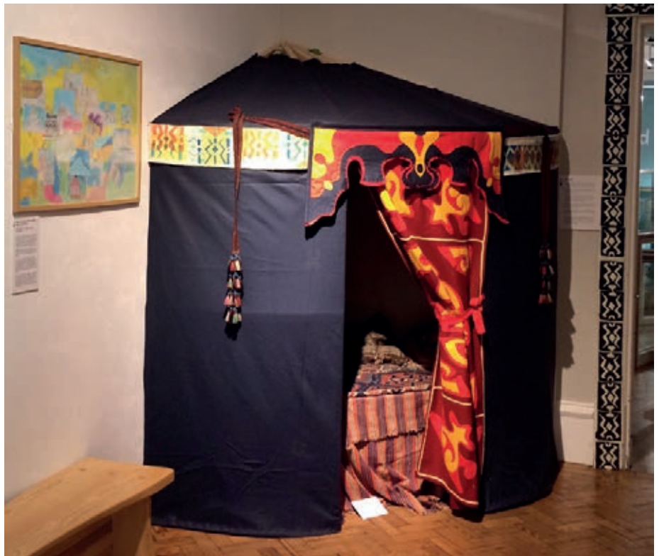
FAR LEFT Winning entry to the Atkinson travels competition on display at the Cooper Gallery