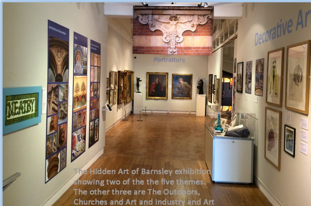
The Hidden Art of Barnsley exhibition showing two of the the five themes. The other three are The Outdoors, Churches and Art and Industry and Art

We have organized an exhibition at the Cooper Gallery. This closes on 30 th August 2014. Admission is free. This final day will be special. There will be a variety of not to be missed activities including music specially written, a storyteller in the gallery, opportunities to have your children's portrait drawn and craft workshops to make a reminder of the exhibition and other attractions.