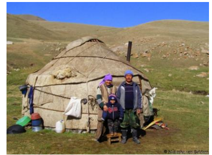
Family in a Yurt