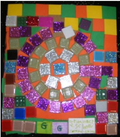
Example of Greenacre pupils' work

At Greenacre School for children and young people with special educational needs, Jen with volunteers has delivered 7 classes on Decorative Art with reference to Neatby , and scenery and wild life with reference to Abel Hold .