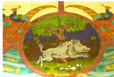
An example of Neatby tiles in Harrods Meat Hall